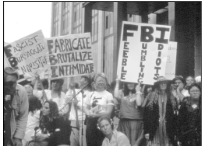
Rally at FBI Headquarters, August 1990

We've got a number of dates we'd like you to be aware of. Hopefully you can come and support us at some of our upcoming rallies, benefits and court appearances.